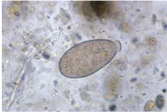
Fasciolopsis buski eggs: Note open operculum (right)