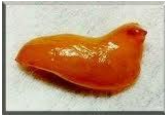
Adult worms - fresh